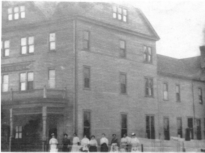
Home for Unwed Mothers